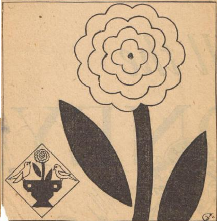
Garden Bouquet Quilt—Block 10—Zinnia